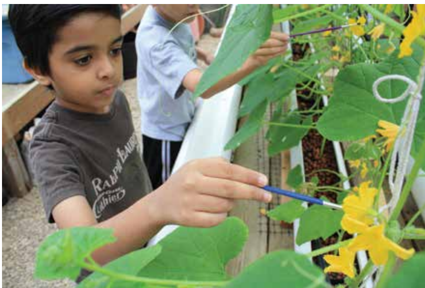
Pollinating cucumbers with a paintbrush

Crosscutting Concept: Structure and Function). One student asked, “What about our plants? How will they get pollinated if they’re inside?” Great question! (NGSS Disciplinary Core Idea: LS2.A Interdependent Relationships in Ecosystems: Plants depend on animals for pollination or to move their seeds around).